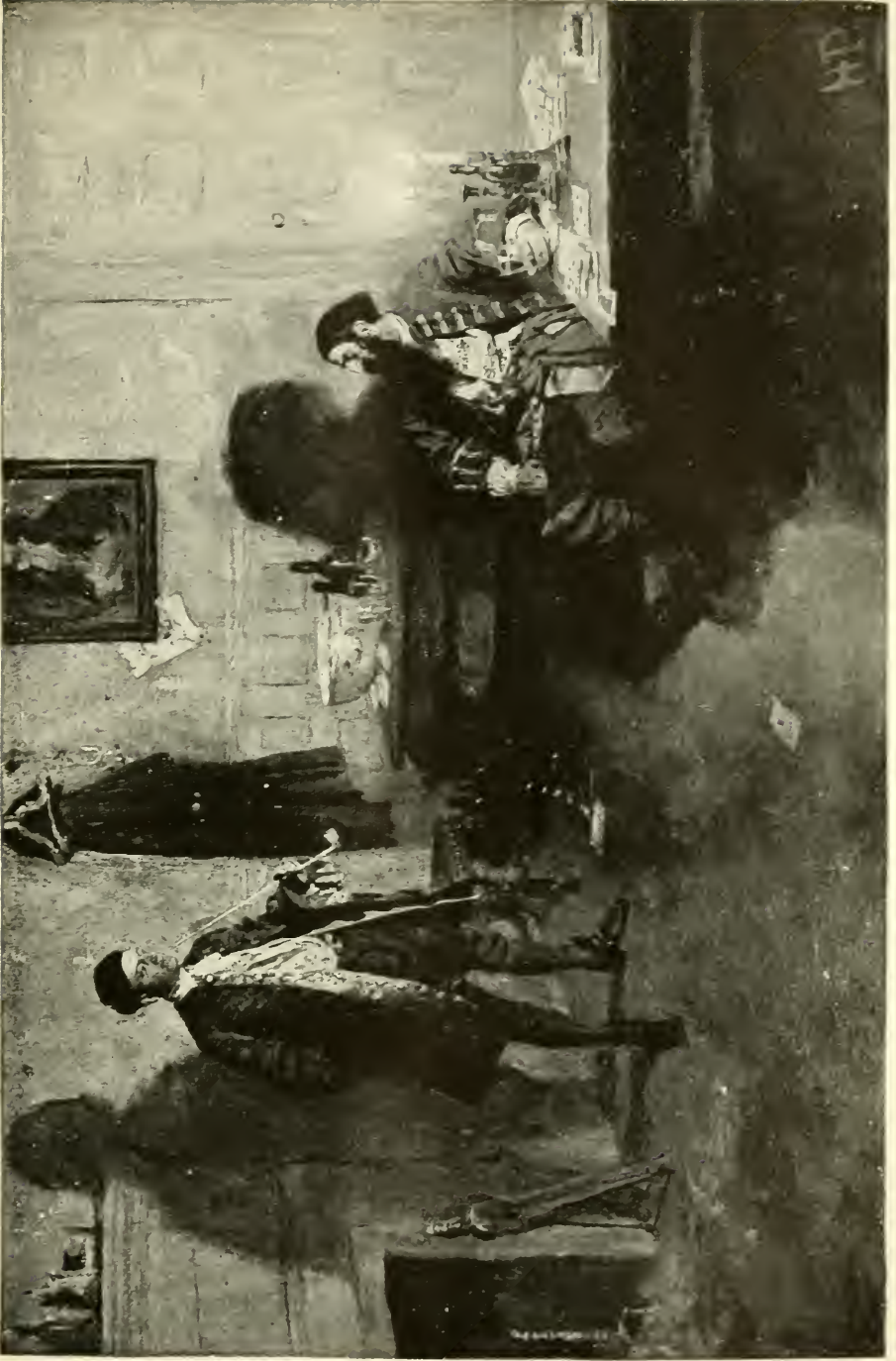
"MR. PARKER STOOD LOOKING STEADILY AT HIS VISITOR."