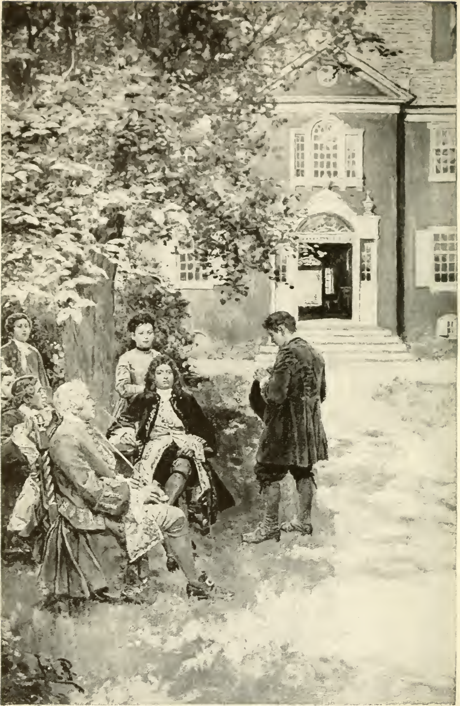
“SPEAK UP, BOY; SPEAK UP,” SAID THE GENTLEMAN.” (SEE PAGE 90.)