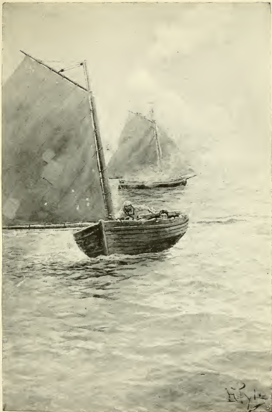
THE PIRATES FIRE UPON THE FUGITIVES.