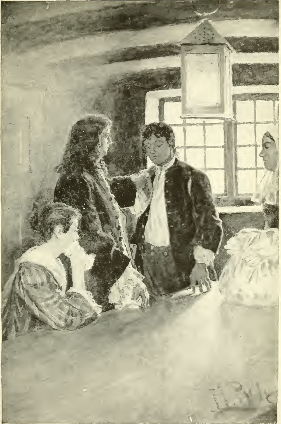
“COLONEL PARKER REACHED AND LAID HIS HAND UPON JACK’S SHOULDER. ‘AY,’ SAID HE, ‘T IS A GOOD HONEST FACE.’”