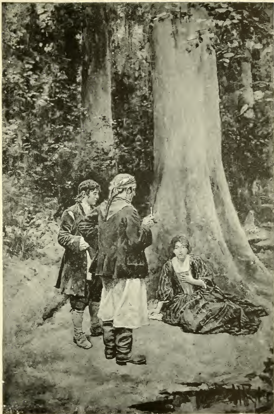
"THEY FOUND HER STILL SITTING IN THE SAME PLACE."