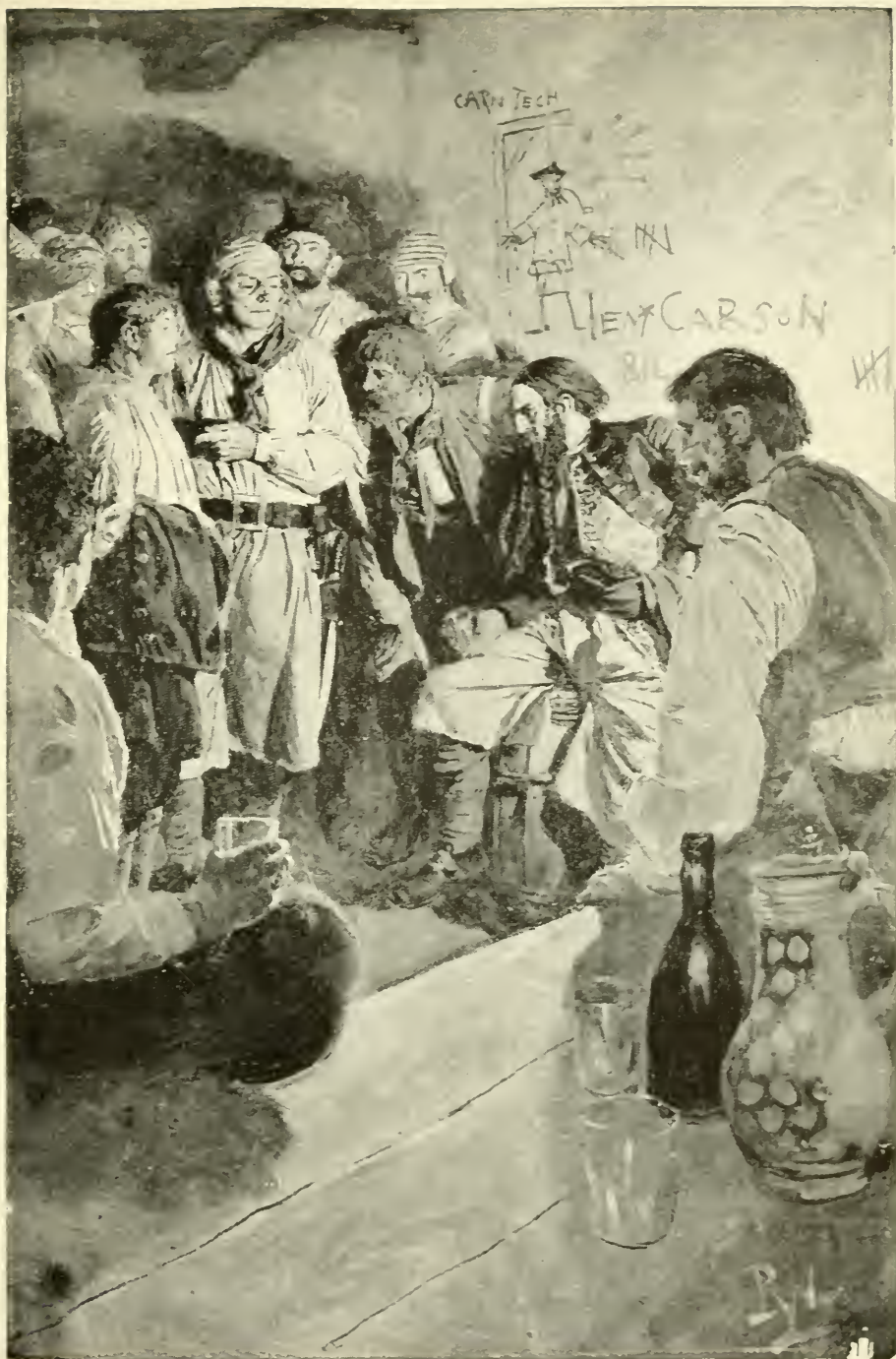
"HE LED JACK UP TO THE MAN WHO SAT UPON A BARREL."