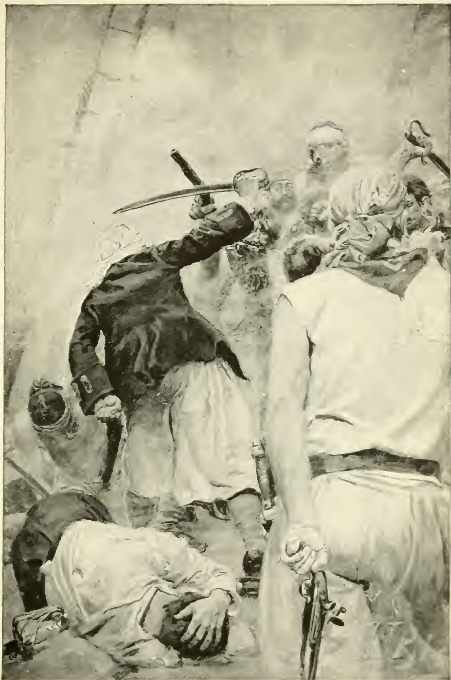
“THE COMBATANTS CUT AND SLASHED WITH SAVAGE FURY.”